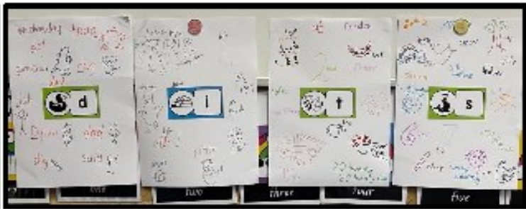
Learning about sounds with KG! KG have made... Phoneme posters! Buzzing Bees! Jiggly Jellyfish! Rigid Robots!